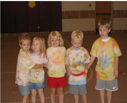
Children celebrating the glory of God's creation of color.

Seedling's Ministries is a collection of programs supporting children, youth and families in Edina, MN. We are committed to partnering with parents in nurturing their child's faith in God. We are happy to care for and teach God's word to your children and we strive to provide a warm, loving, safe environment for your little one. We want to minister to each infant, toddler and preschooler with the same love and compassion God has for us.